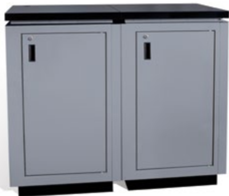
Double 23" x 46" x 39.5"h