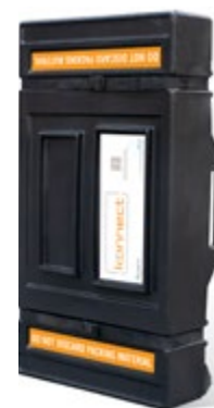
Roto-Molded Case 51" x 27" x 14"h