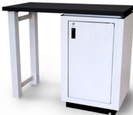
Konnnect LE (Leg Extension) 23" x 46" x 39.5"h